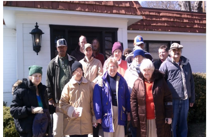
Members at 8 Sinaway Rd, new home of the psychosocial day program.

program offers an alternative to live more fulfilling lives with purpose.