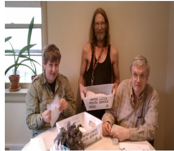
Members hard at work in mail service.

Greenwich Adult Day-Care League of Women Voters Stamford Academy of Jewish Education